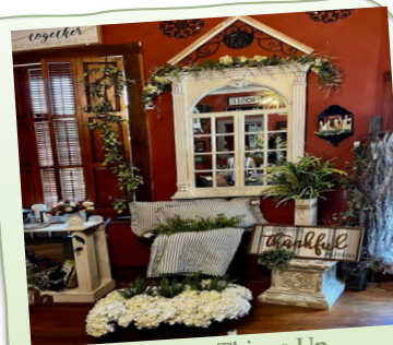
Changing Things Up 121 Taylor Street Cannelton, IN