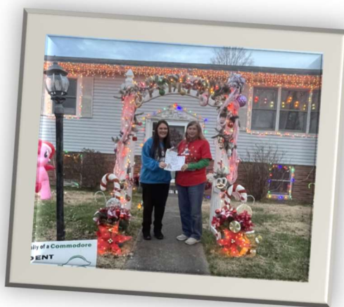
Ransom-9 Pleasant Valley Drive